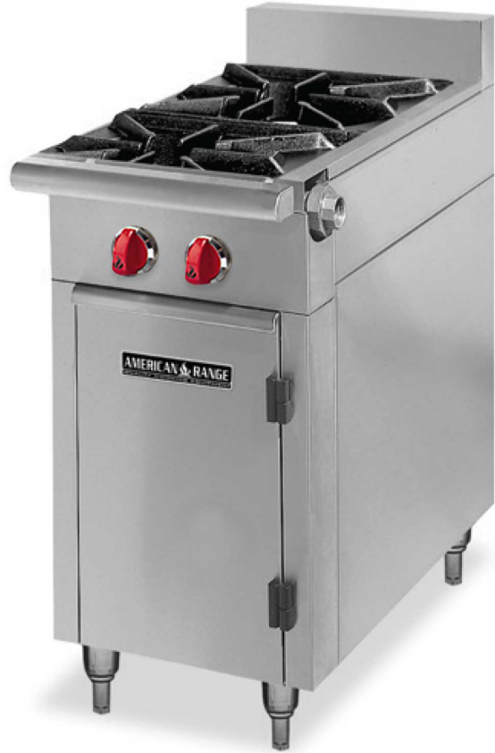
Model Shown HD17-2-0 Shown with optional background